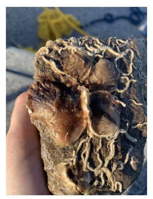
Figure 3. Figure 3. Oysters and other reefforming organisms adhere to the limestone rock used to restore the reef. The oysters will continue to grow over time, contributing to the restored reef and surrounding ecosystem.

This oyster reef restoration project was constructed in 2021 by The Nature Conservancy and is envisioned as part sanctuary and harvestable reef. At around 40 acres in size, 25 are open for commercial oyster harvest, with 15 acres to be preserved (not harvestable) as a broodstock sanctuary reef. This design allows for a sustainable approach to commercial oyster harvest. The sanctuary reef is expected to provide a nearby source of larvae to the harvestable areas. Additionally, the new oyster reefs in this site will help filter coastal waters, enhance water quality, and provide food and shelter for different fish species, shrimp, crabs, and other invertebrates.