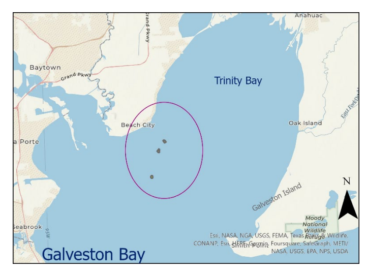
Figure 2. The oyster reef restoration site known as Beezley Reef in Galveston-Trinity Bay complex in coastal Texas.

The Beezley reef restoration site is located within the Galveston-Trinity Bay complex, along the mid coast of Texas. Funding for the restoration effort was initially provided by the National Fish and Wildlife Foundation through the Gulf Environmental Benefit Fund. Additional funds were provided by Cummins Foundation, Inc. and CenterPoint Energy Foundation. This project has been managed in partnership between The Nature Conservancy, Galveston Bay Foundation, and Texas Parks and Wildlife Department. Texas Water Development Board provided additional support for this project.